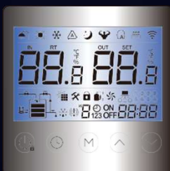
5 Intelligent Mode